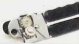
2 can opener