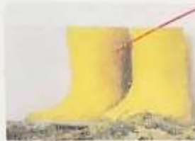
5 rubber boots