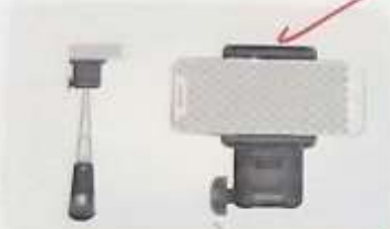
4 selfie stick