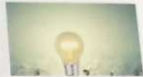
3 light bulb